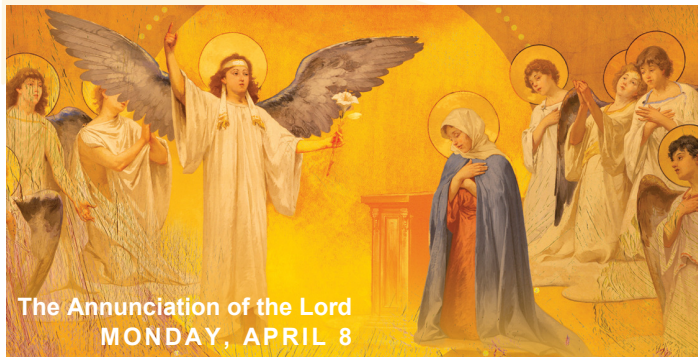
The Annunciation of the Lord MONDAY, APRIL 8

Mary's acceptance of her pregnancy made her the first to believe in Jesus and thus, the first Christian.