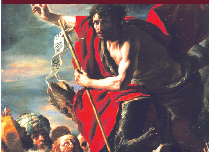
"Prepare the way of the Lord." - Mk 1:3