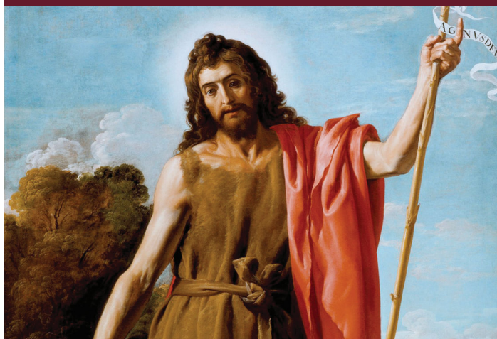
John wore clothing made of camel's hair and had a leather belt around his waist. His food was locusts and wild honey. - Mt 3:4

PARISH PASTORAL COUNCIL MISSION STATEMENT As disciples of Jesus Christ serving on the Parish Pastoral Council, we collaborate with the Pastor and Staff inviting the people of St. John the Evangelist Church to joyfully celebrate the Eucharist, faithfully teach Catholic tradition, and fervently form Catholic spirituality, so that together we may go forth in love to serve the Lord and each other.