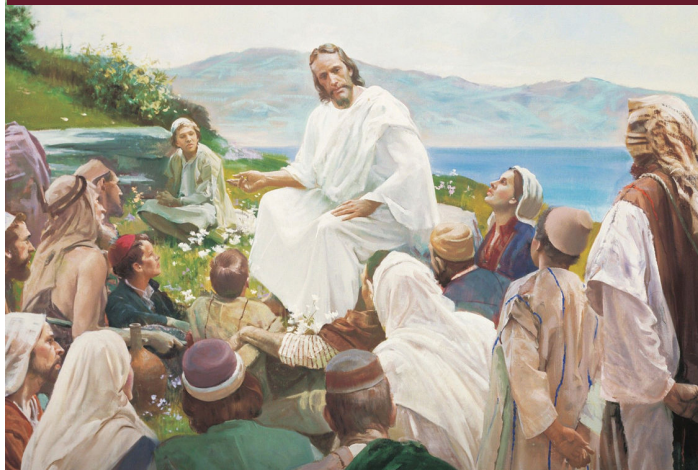
After John had been arrested, Jesus came to Galilee proclaiming the gospel of God: "This is the time of fulfillment. The kingdom of God is at hand. Repent, and believe in the gospel." - Mk 1:14-15