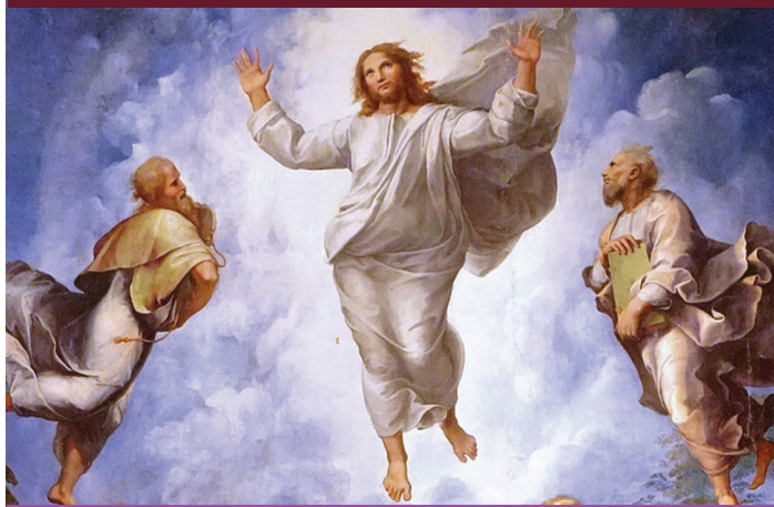
Then a cloud came, casting a shadow over them; from the cloud came a voice, "This is my beloved Son. Listen to him." Suddenly, looking around, they no longer saw anyone but Jesus alone with them. - Mk 9:7-8

PARISH PASTORAL COUNCIL MISSION STATEMENT As disciples of Jesus Christ serving on the Parish Pastoral Council, we collaborate with the Pastor and Staff inviting the people of St. John the Evangelist Church to joyfully celebrate the Eucharist, faithfully teach Catholic tradition, and fervently form Catholic spirituality, so that together we may go forth in love to serve the Lord and each other.