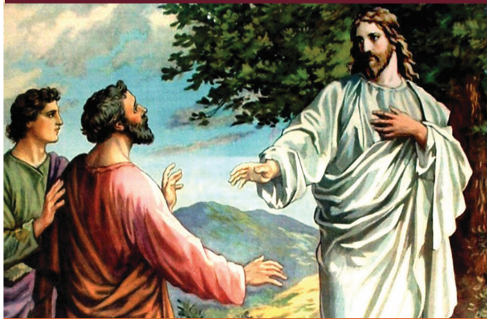
He walked along a little farther and saw James, the son of Zebedee, and his brother John. They too were in a boat mending their nets. Then he called them. So they left their father Zebedee in the boat along with the hired men and followed him. - Mk 1:19-20