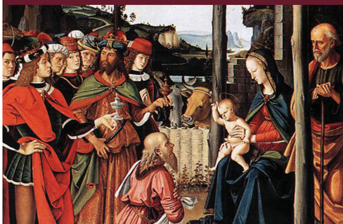
When Jesus was born in Bethlehem of Judea, in the days of King Herod, behold, magi from the east arrived in Jerusalem, saying, "Where is the newborn king of the Jews? We saw his star at its rising and have come to do him homage." - Mt 2:1-2