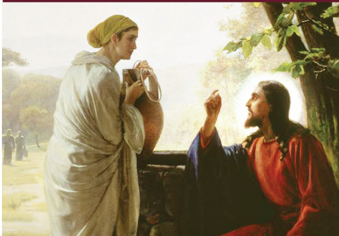
Jesus answered and said to her, "If you knew the gift of God and who is saying to you, 'Give me a drink,' you would have asked him and he would have given you living water." - Jn 4:10

PARISH PASTORAL COUNCIL MISSION STATEMENT As disciples of Jesus Christ serving on the Parish Pastoral Council, we collaborate with the Pastor and Staff inviting the people of St. John the Evangelist Church to joyfully celebrate the Eucharist, faithfully teach Catholic tradition, and fervently form Catholic spirituality, so that together we may go forth in love to serve the Lord and each other.