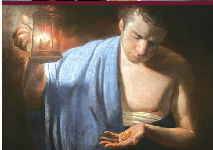
“Well done, my good and faithful servant.” – Mt 25:21

PARISH PASTORAL COUNCIL MISSION STATEMENT As disciples of Jesus Christ serving on the Parish Pastoral Council, we collaborate with the Pastor and Staff inviting the people of St. John the Evangelist Church to joyfully celebrate the Eucharist, faithfully teach Catholic tradition, and fervently form Catholic spirituality, so that together we may go forth in love to serve the Lord and each other.