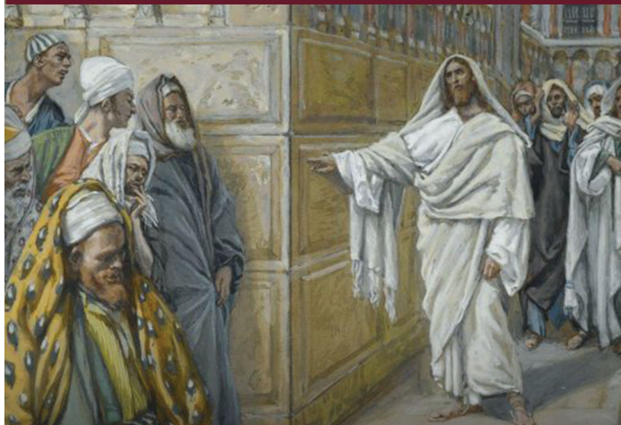
"The stone that the builders rejected has become the cornerstone." - Mt 21:42ab

PARISH PASTORAL COUNCIL MISSION STATEMENT As disciples of Jesus Christ serving on the Parish Pastoral Council, we collaborate with the Pastor and Staff inviting the people of St. John the Evangelist Church to joyfully celebrate the Eucharist, faithfully teach Catholic tradition, and fervently form Catholic spirituality, so that together we may go forth in love to serve the Lord and each other.